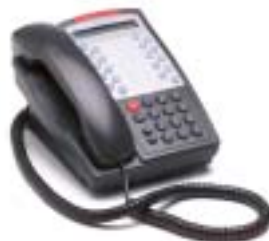
Mitel Networks 5005 IP Phone