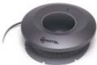
Mitel Networks 5305 Conference Unit

Mitel Networks Small Business Solutions offer the greatest choice and flexibility available from a single provider, from entry-level systems to sophisticated, feature-rich solutions.