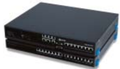
Mitel Networks 3100 Controller and Expansion Unit