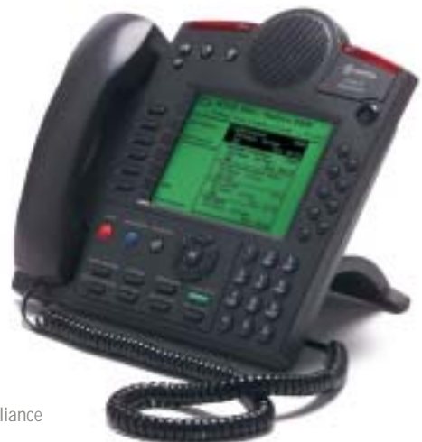
Mitel Networks 5140 IP Appliance

Work your way – in the office, at home or on the road – with easy-to-use, time-saving phone, messaging and Internet tools. With Mitel Networks Small Business Solutions, your employees will be able to share information efficiently and effectively, personalize their communication tools quickly and conveniently, and easily manage changes to the system without the help of a technician.